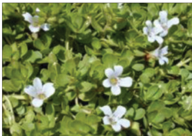
Figure 1: Bacopa monniera herb