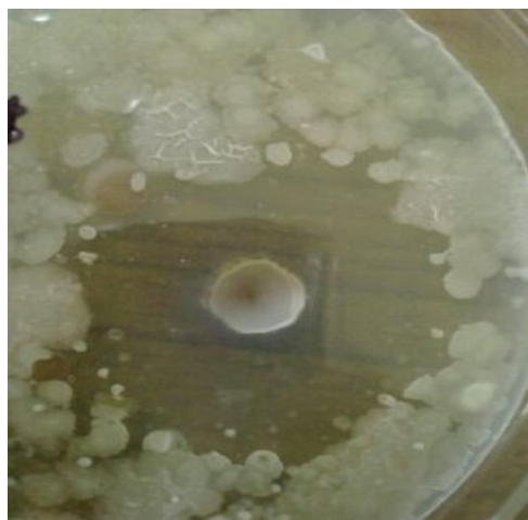
Fig. 4. Antidandruff activity of Ketoconazole against M.furfur .