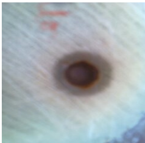
Fig. 2. 100 ppm material.